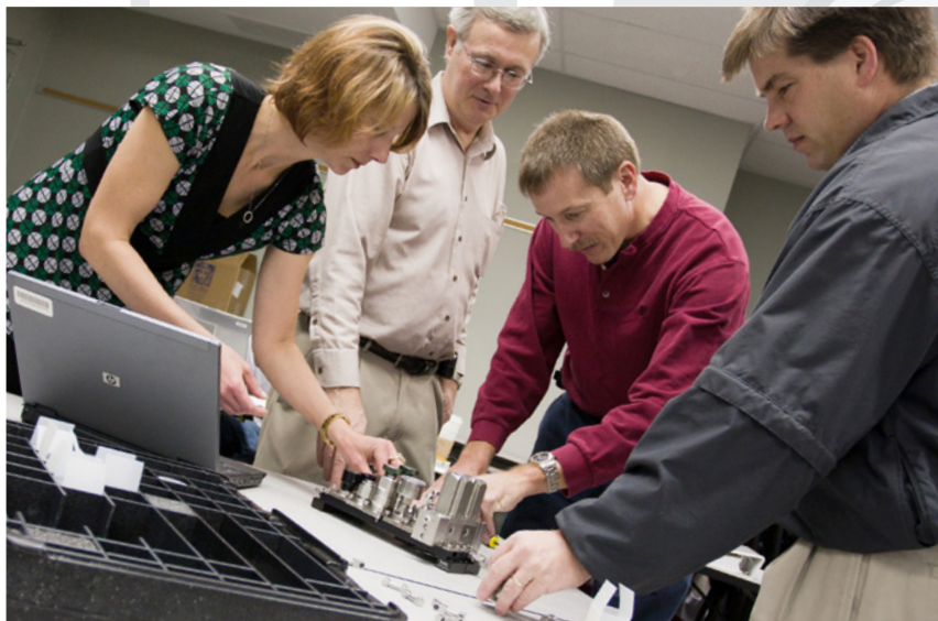
Students participate in an interactive exercise, designing and building a sampling system.

If you design, construct, operate or maintain sampling systems, you know how important quality data is. Inaccuracy usually results from problems within the sampling system, not the analyzer. With our hands-on training, we teach you to tell the difference.